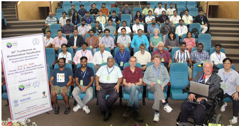
CMG2024 group photo

The conference was preceded by a three-day pre-conference workshop on ‘ Computational Geosciences for Sustainable Development ’ (30 May to 1 June). A variety of topics, such as geo-statistics, geospatial technology, mathematical morphology, nonlinear signal analysis techniques, computational geodynamics, geodesy, and seismic tomography were covered in the workshop. Eminent lecturers from India and abroad delivered lectures in the workshop. About twenty students from various colleges and universities from India attended the workshop. Feedback from the participants of the workshop and the conference was positive and their comments will be considered by the CMG Executive Committee.