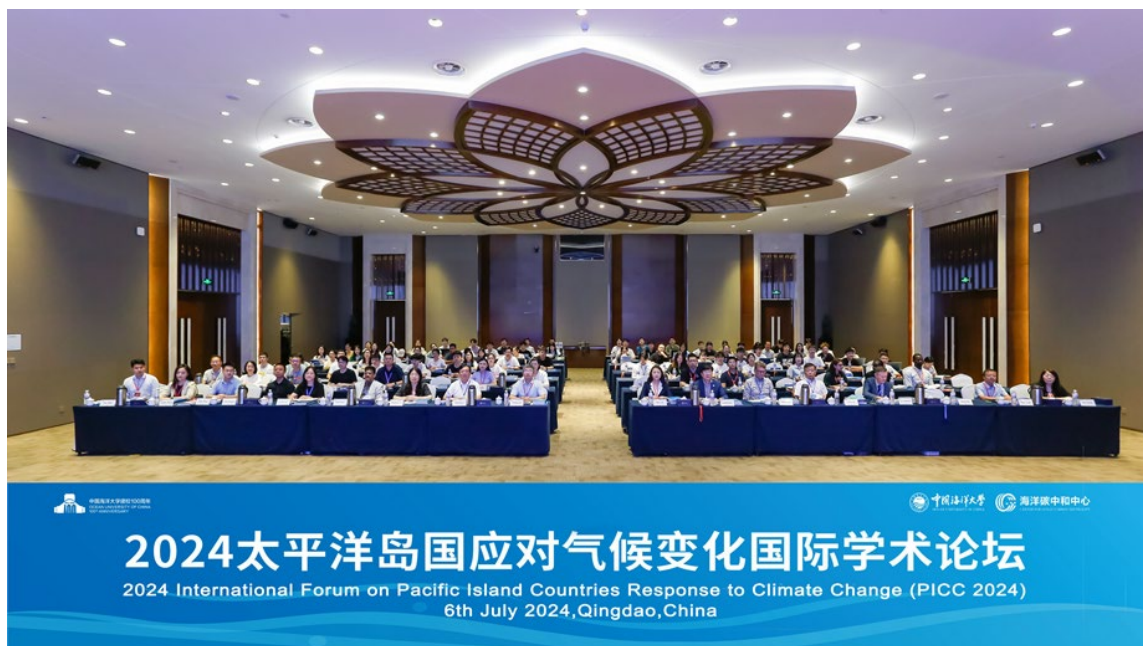
PICC2024 group photo

In conclusion, PICC 2024 was a successful event, thanks to the generous co-sponsorship from International Association of Meteorology and Atmospheric Sciences (IAMAS), IUGG Union Commission on Climatic and Environmental Change (CCEC) and other agencies. The forum called for urgent efforts to accelerate climate action and explore solutions to help PICs better cope with climate change and achieve sustainable development.