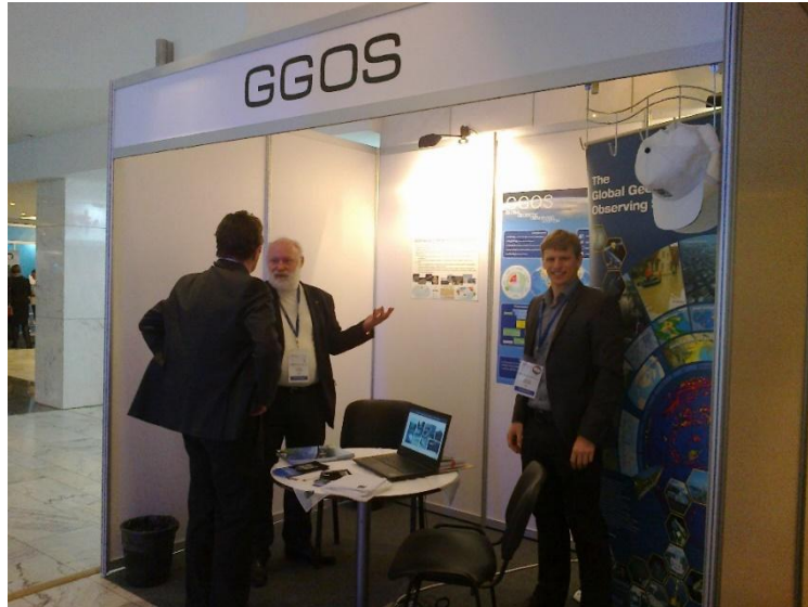
GGOS booth at the GEO Plenary XIII

Being Participating Organizations, IUGG, GGOS of IAG and the International Ozone Commission (IO3C) of IAMAS participated in the event organizing a panel session as a side event and participating in the GEO exhibition.