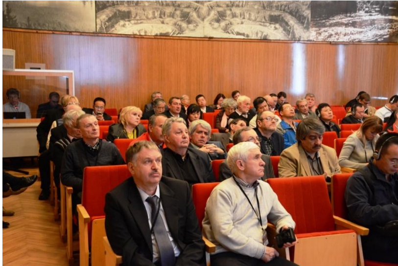
At a workshop session

the Kola Scientific Center of the Russian Academy of Sciences (RAS). The meeting aimed at improving information exchange on achievements in geomechanics and engineering seismology, and it reflected the main goals of the IASPEI Commission on Earthquake Generation Process: Physics, Modeling and Monitoring for Forecast 2 . 103 scientists and engineers participated in the meeting, and 15 plenary lectures were delivered. The submitted abstracts were published in the Abstract Volume and distributed to participants.