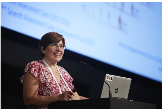
Valérie Masson-Delmotte, IUGG Gold Medalist