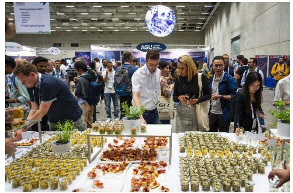
Opening Ceremony and Reception