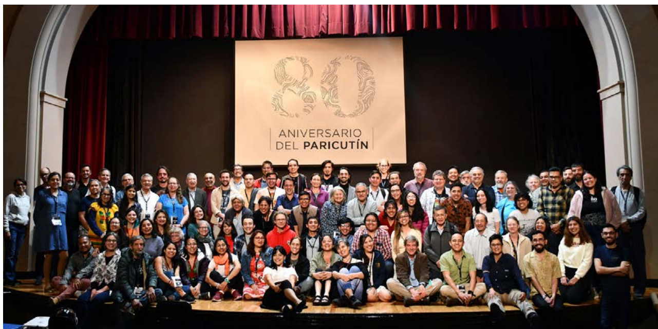
Photograph of the conference participants, Morelia, 23 February 2023

The international conference ‘Commemorating the 80 th anniversary of Parícutin volcano: Preserving our heritage and preparing for future eruption’ took place at Morelia, Michoacán, México, from 19 to 24 February 2023, and was organised by the Universidad Nacional Autónoma de México (UNAM) and la Universidad Michoacana de San Nicolás de Hidalgo (UMSNH).