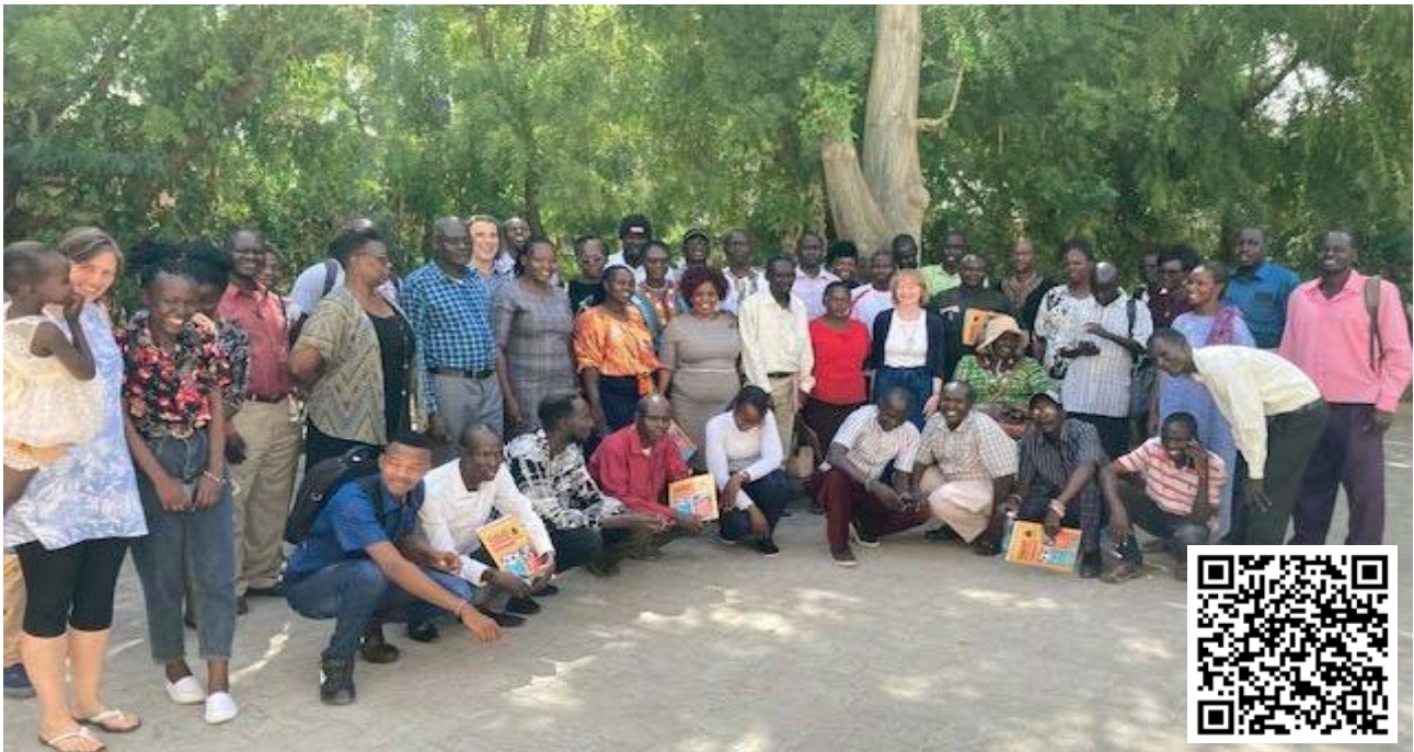
Onsite participants of the two days formative event for teachers