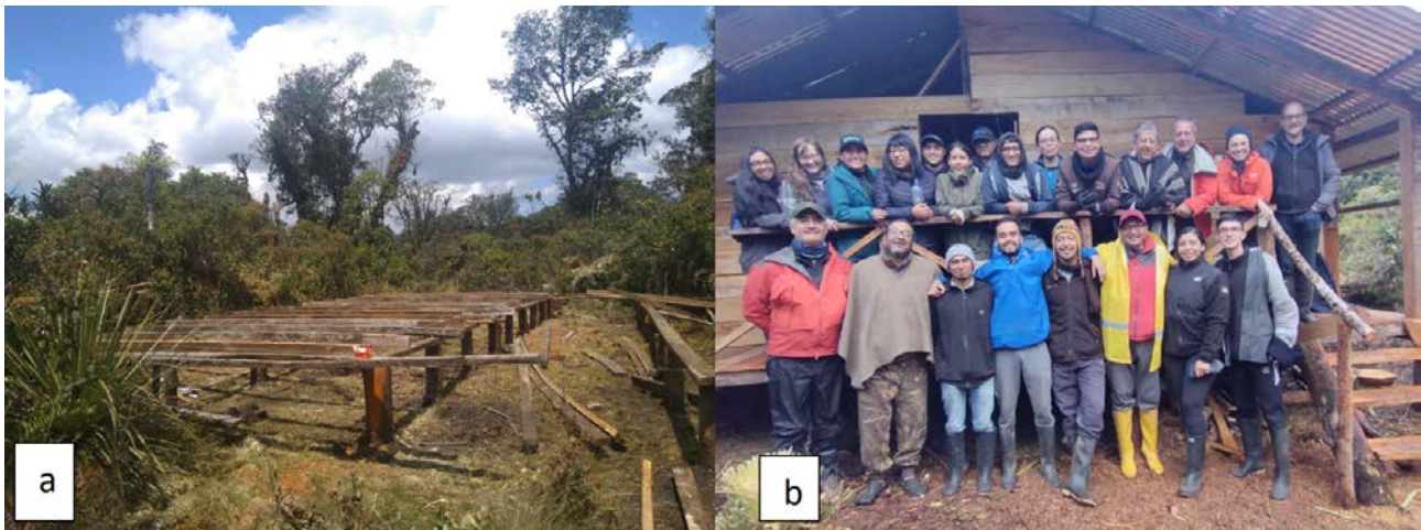
(a) basement of the building and (b) finished meeting room with participants of the workshop

The meeting was held on the slopes of the Patascoy Mountain, located 0.9442^{\circ} N, 77.0725^{\circ} W, in Colombia. In order to reach Patascoy it was necessary to travel by boat for almost five hours. The meeting was split into two parts, one devoted to talks and discussions before travelling to Patascoy, and a second part held on its slopes, where it was necessary to condition the place and to build an auditorium in the middle of the jungle (see picture). The 29 meeting participants included scientists, students and community members from Italy, Peru, Ecuador, and Colombia.