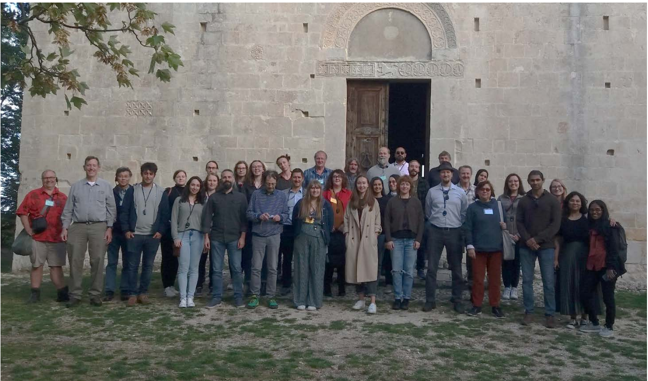
Participants of the course “Radiation Belt Dynamics and Remote Sensing of the Earth's Plasmasphere”

The IUGG financial support was used for the course organisation and for supporting the participation of students from Poland, Brazil, and France at reduced rates.